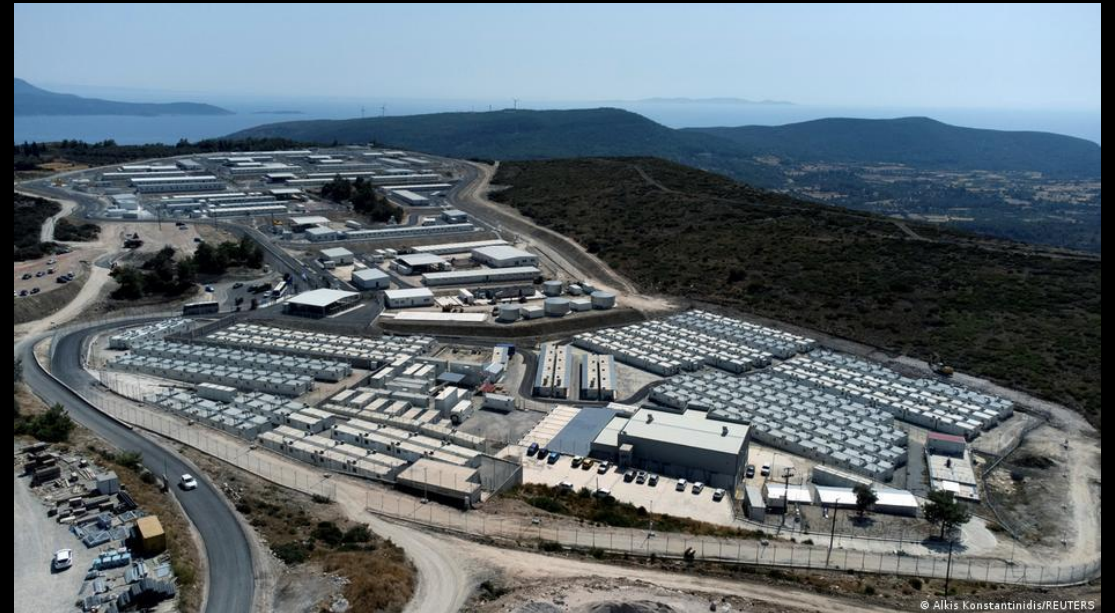
The new facility on Samos island

By Info Migrants, Benjamin Bathke. Published on : 2021/09/02